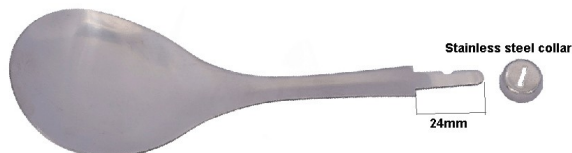
Diagram A - Parts and Assembly

Generally, the size of your wood or acrylic blank should approximately 1-1/2" x 1-1/2" x 7" long. Mark the center of the blank on the end. Using a medium drill speed, drill a 7mm diameter hole x 27mm deep.